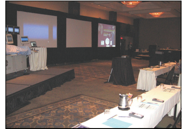
CARDIOVASCULAR INSTITUTE/BOSTON SCIENTIFIC SEMINAR