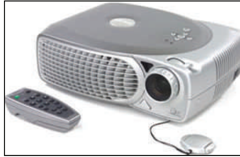
DELL 2200 LCD PROJECTOR

www.audiovisualrentalservices.com (215) 416-0905 / (866) 907-6075